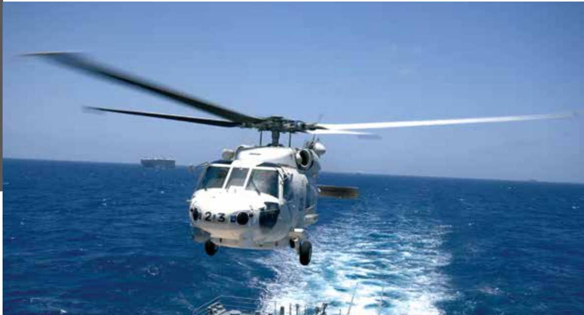
SH-60K Helicopter