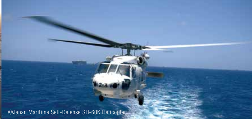
SH-60K Helicopter

Mitsubishi Corporation Machinery, Inc. is a professional trading company in the field of machinery and components that was established in 1982 as a wholly owned subsidiary of Mitsubishi Corporation's Machinery Group. The company started out with a staff of 17 people and a turnover of 3 billion yen.